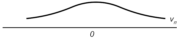
Figure 2: Long range variable mass

Our paper is motivated by extending constant mass cases to variable ones. Namely, going beyond the case of constant masses, we consider the infrared behavior of the Nelson model with variable masses. From the argument mentioned above it is expected that the Nelson model may have ground states if the variable mass decays sufficiently slowly in a neighborhood of origin (Fig. 2),