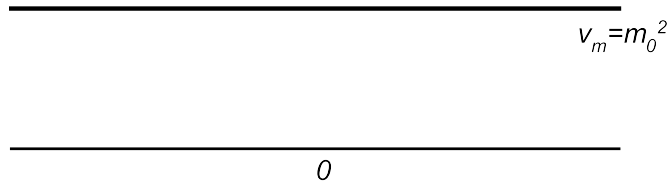
Figure 1: Positive constant mass

We are interested in investigating the infrared behavior of the Nelson model. In